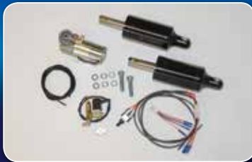
Touring Rear Kit