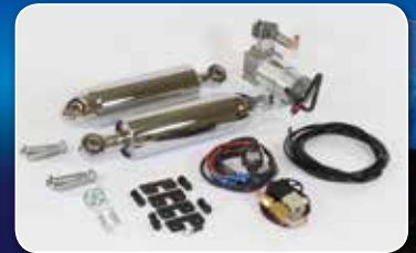
V-ROD Rear Kit

Visit us on-line or contact one of our factory consultants for your fitment and application.