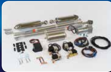
V-ROD Front and Rear Kit