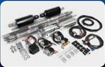
Touring Front and Rear Kit